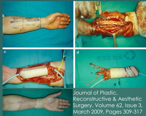
Journal of Plastic, Reconstructive & Aesthetic Surgery. Volume 62, Issue 3, March 2009, Pages 309-317

- Search terms: phalloplasty, radial, forearm, donor site, complication, and flap - Two authors performed independent reviews of the literature within the PubMed and Ovid/Medline databases