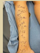
Figure 1: Time, catheter position, and balloon volume recorded on patients right lower extremity