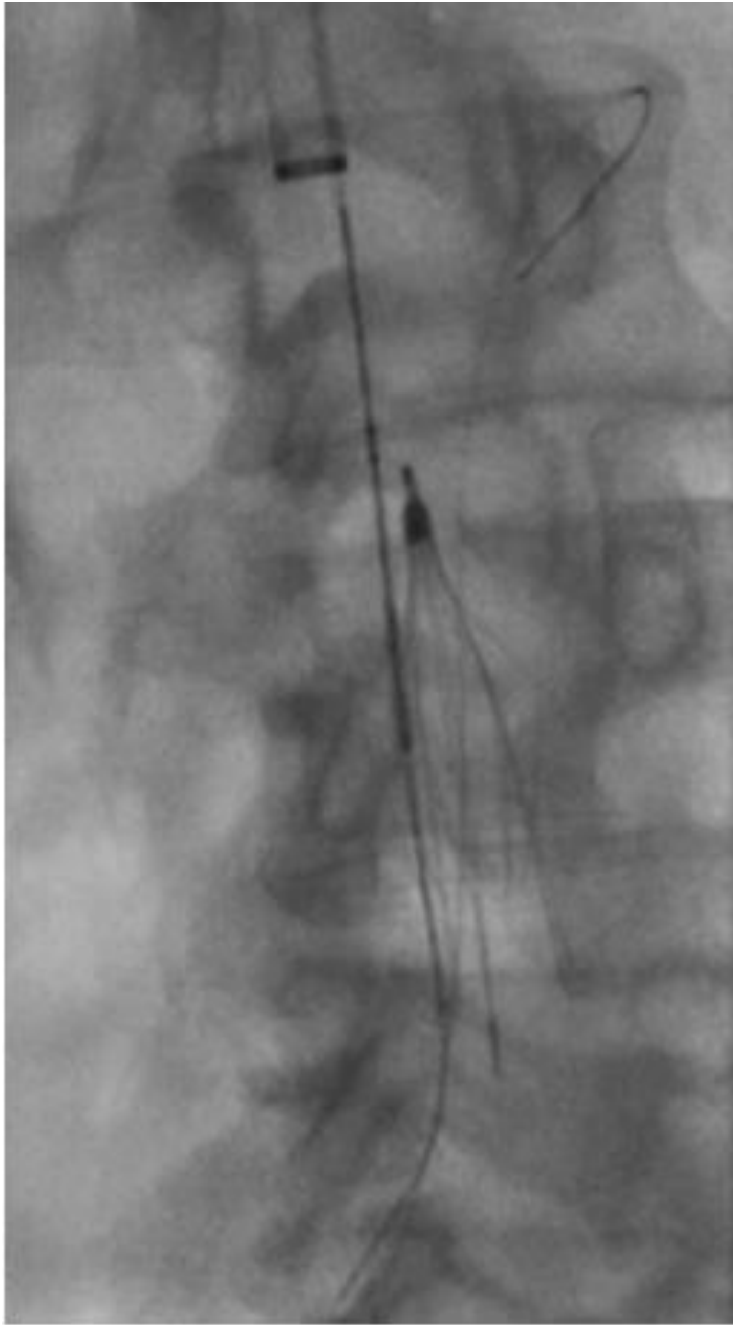
Figure 2: After unsuccessfully attempting to cross the IVC chronic total occlusion (CTO) with different wires and support catheters, a 2.9 mm Upstream GoBack Catheter was used with a Winn 200T 0.014" wire to cross the CTO.