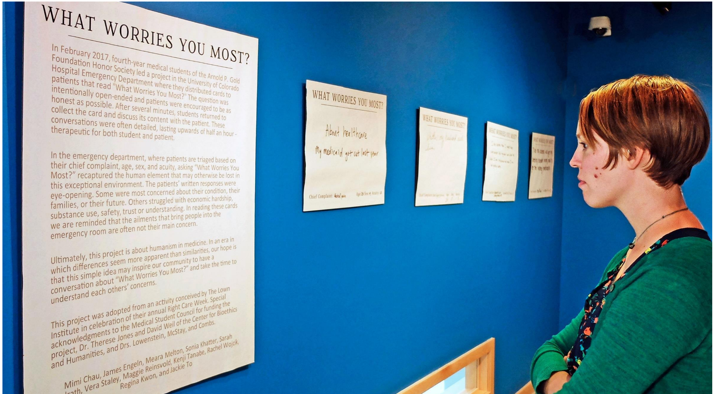
A physical therapy visiting What Worries You Most? exhibit.