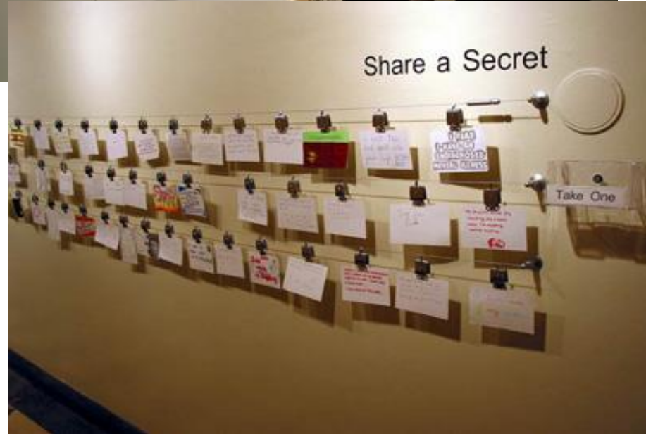
What Worries You Most? Exhibit at the Fulginiti Pavilion.