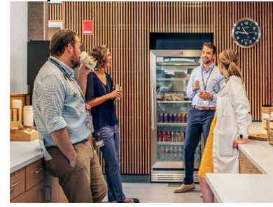
Alternate collaborative spaces